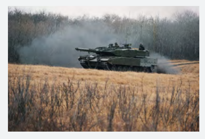
ABOVE · Training in Wainwright in a Leopard 2A4M main battle tank.

I have found myself leaning on my faith and the lessons I learned at BVCS to strengthen and guide me.