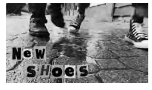
ABOVE · "New Shoes", a student-made video short.

After watching it as a class, there were many whispers of "That was really good. Like, really good" from their peers. Story-telling is an essential part of what it means